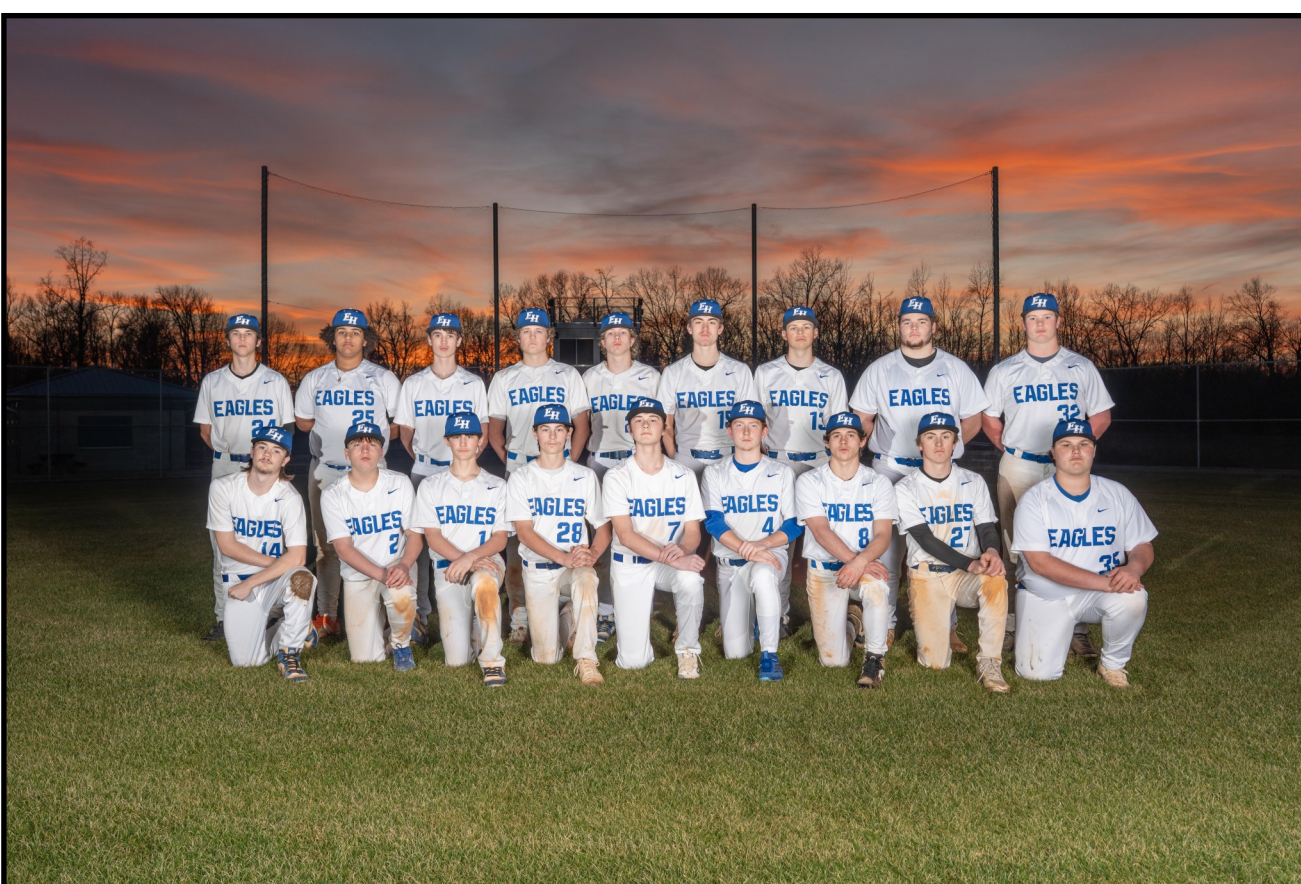
The 2025-2026 EHHS Baseball Team