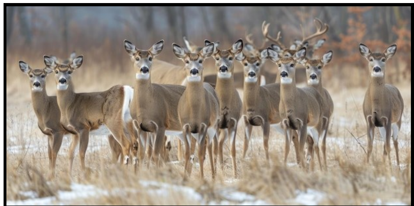
A Small Portion of EHHS's deer herd ready to be released onto the 500 Acres!

Overall, the hunting team will helping out not only just the team and the school, but also the whole community and will help with the deer population in Hickman county and the surrounding counties.