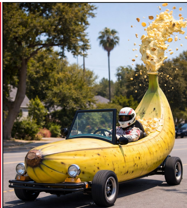
A picture of the “Bananamobile”