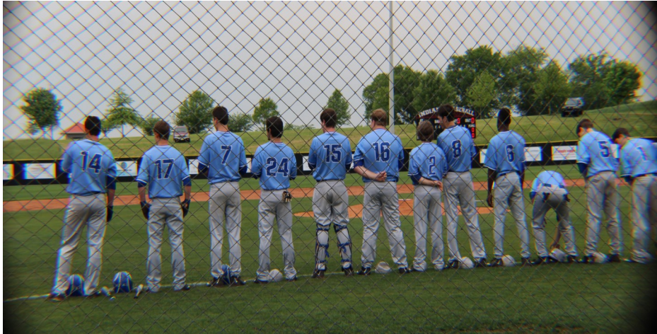
The Eagles have the most season wins in school history!