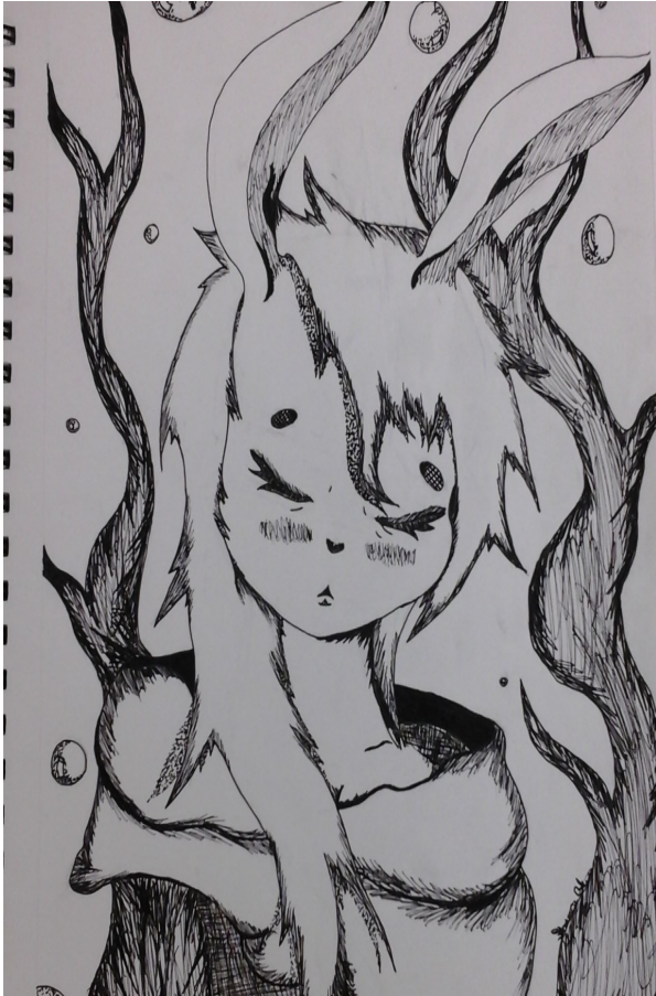
Shawn Clouse- "Drowning"