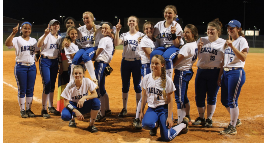
Softball photos courtesy of Michele Griggs.