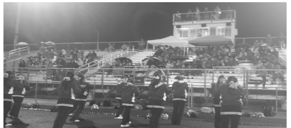
The game went on to victory despite the rain!