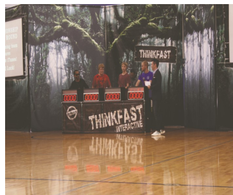
East Hickman High students participate in front of a school-wide assembly.