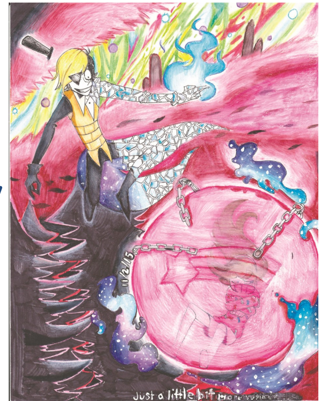
Third place—Skyla Adcock